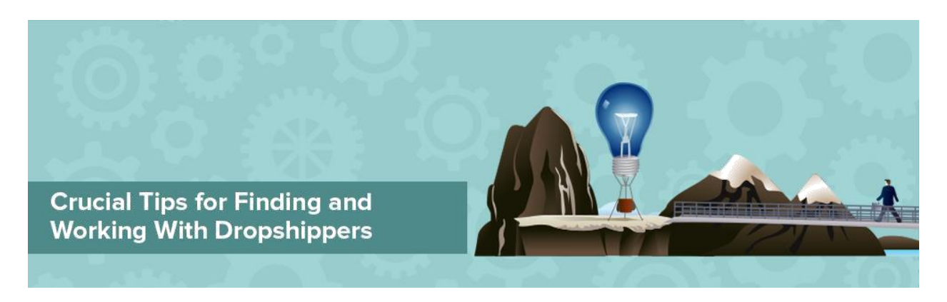
Crucial Tips for Finding and Working With Dropshippers