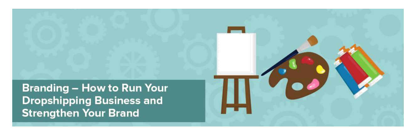
Branding – How to Run Your Dropshipping Business and Strengthen Your Brand

Perhaps the biggest advantage of the dropshipping business model though, is one that many people don't even consider.